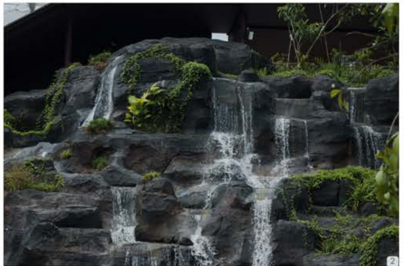
1 and 2: Instead of traditional planter boxes, a soilless planting medium was placed in crevices and cracks between the rocks to support the vegetation. This system allowed the plants to adapt and grow within the cracks, minimising water usage compared to conventional soil-based systems.