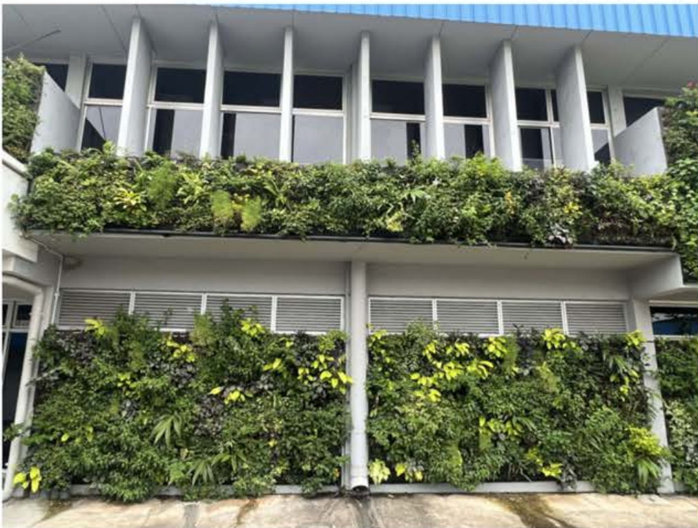
This vertical greenery installation was created with the vision of reintroducing flora and fauna into the industrial estate.

BUILDING OWNER: BLU-CONNECTION PTE LTD IMPLEMENTER: GREENOLOGY PTE LTD