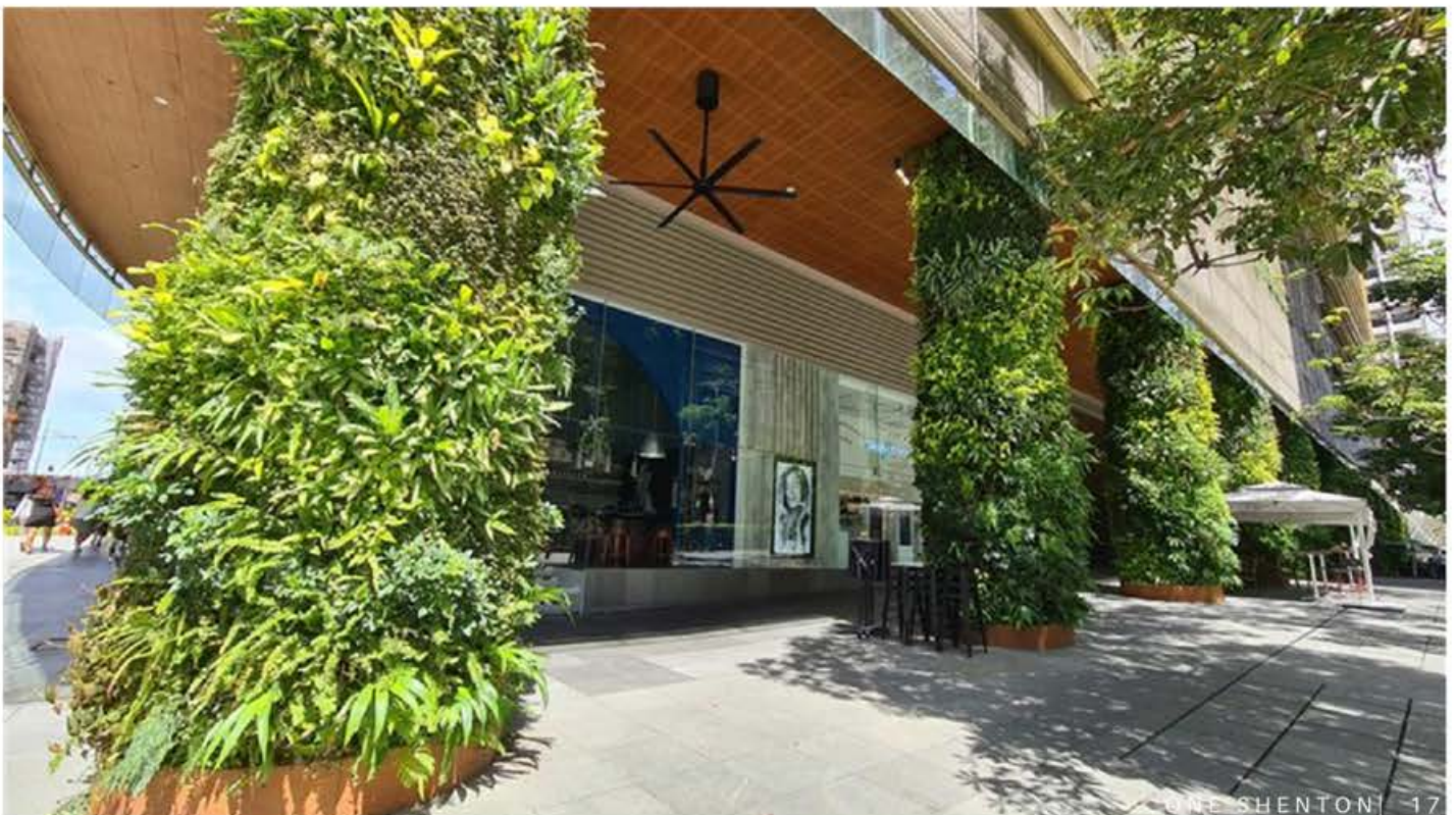
By wrapping its level 1 columns with greenery, One Shenton has enabled the therapeutic effects of greenery to reach out to the people in the busy business district.

The building's design features greenery that wraps around the columns along its level 1 premises, providing visual relief for the building's occupants and members of the public in a busy business district. The green walls not only enhance the building's aesthetics but also help to reduce one's exposure to air pollution, promoting a healthier environment for urban residents and visitors.