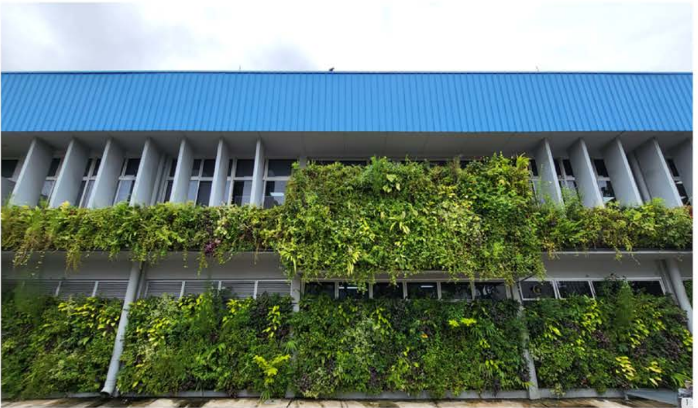
1; 2 and 3: Over 70 species of butterfly-attracting plants were used over two floor of vertical greenery, adding to the ecological resilience of the area.