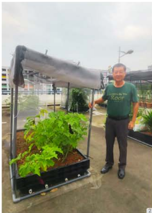
1, 2 and 3: More than just a garden, 'Gardens by the Roof' is a community hub where allotment gardeners introduce innovative sustainable solutions to their plots and bond with their neighbours through the process of gardening.