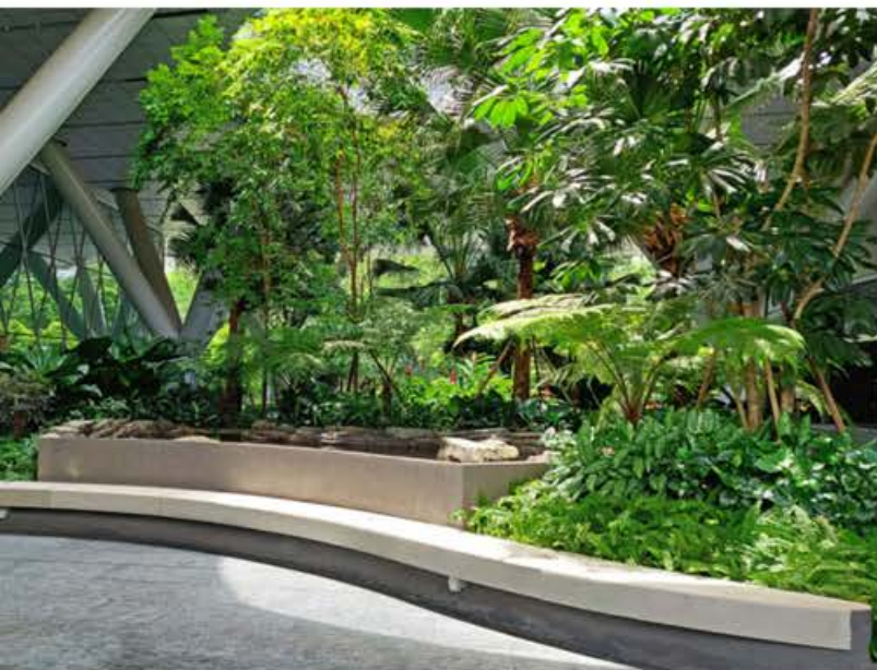
The terracing form of architecture allows sunlight to penetrate through the landscape areas thus eliminating the need to add plant 'grow lights'.

The terracing form of the architecture allows sunlight to penetrate through the landscape areas thus eliminating the need for "grow lights". Native and adaptive plant species were selected to reduce water and maintenance requirements. By selecting these plants, the building conserves water, reduces the need for fertilizers and pesticides, and supports local ecosystems as it forms natural habitats for local flora and fauna.