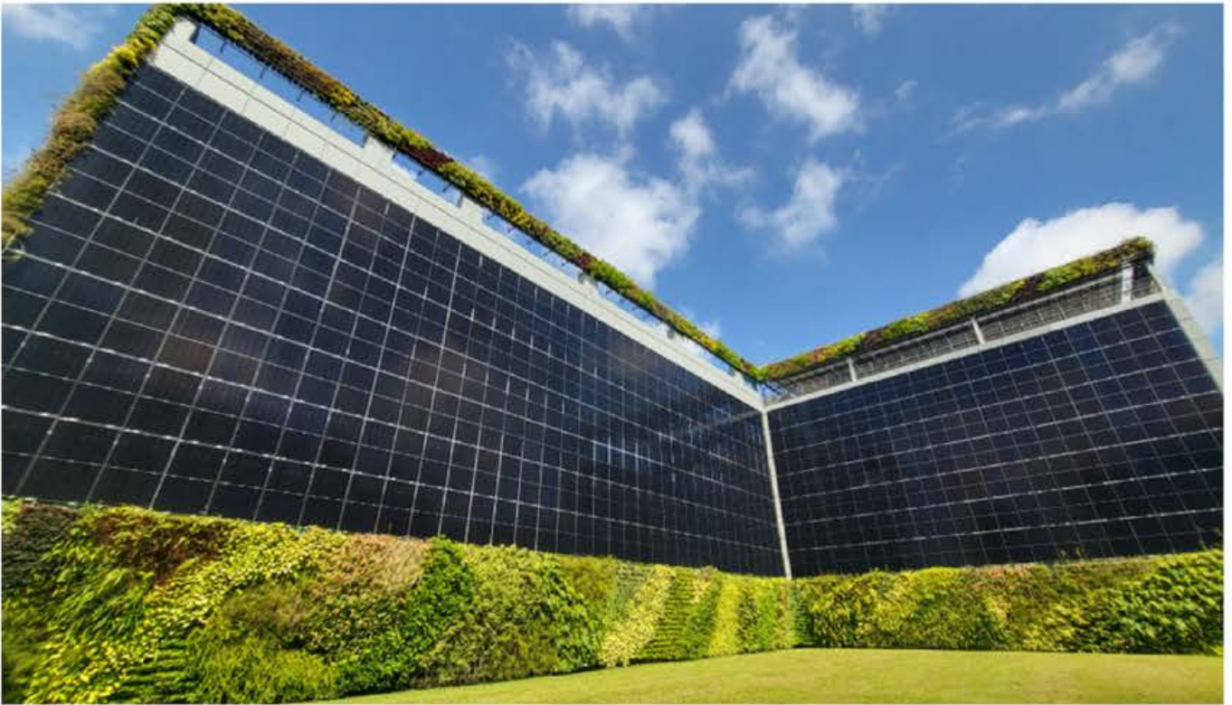
One of the building's main feature is its 910 square meters of vertical greenery being placed alongside vertical solar panels.

The integration of vertical greenery with other features such as highly efficient air-conditioning, smart sensors, LED lights, rainwater harvesting, mechanical ventilation systems as well as solar panels on the rooftop and building facade makes the positive energy rating possible. Over 20 species of plants were used for the green wall including a mix of climbers such as Philodendron scandens , ferns such as Nephrolepis biserrata , and shrubs such as Tabernaemontana divaricata and Schefflera arboricola . The maintenance requirement for the plants is also an important consideration. Hence given the height of the green wall, access pathways for Mobile Elevated Work Platforms (MEWPs) were catered for.