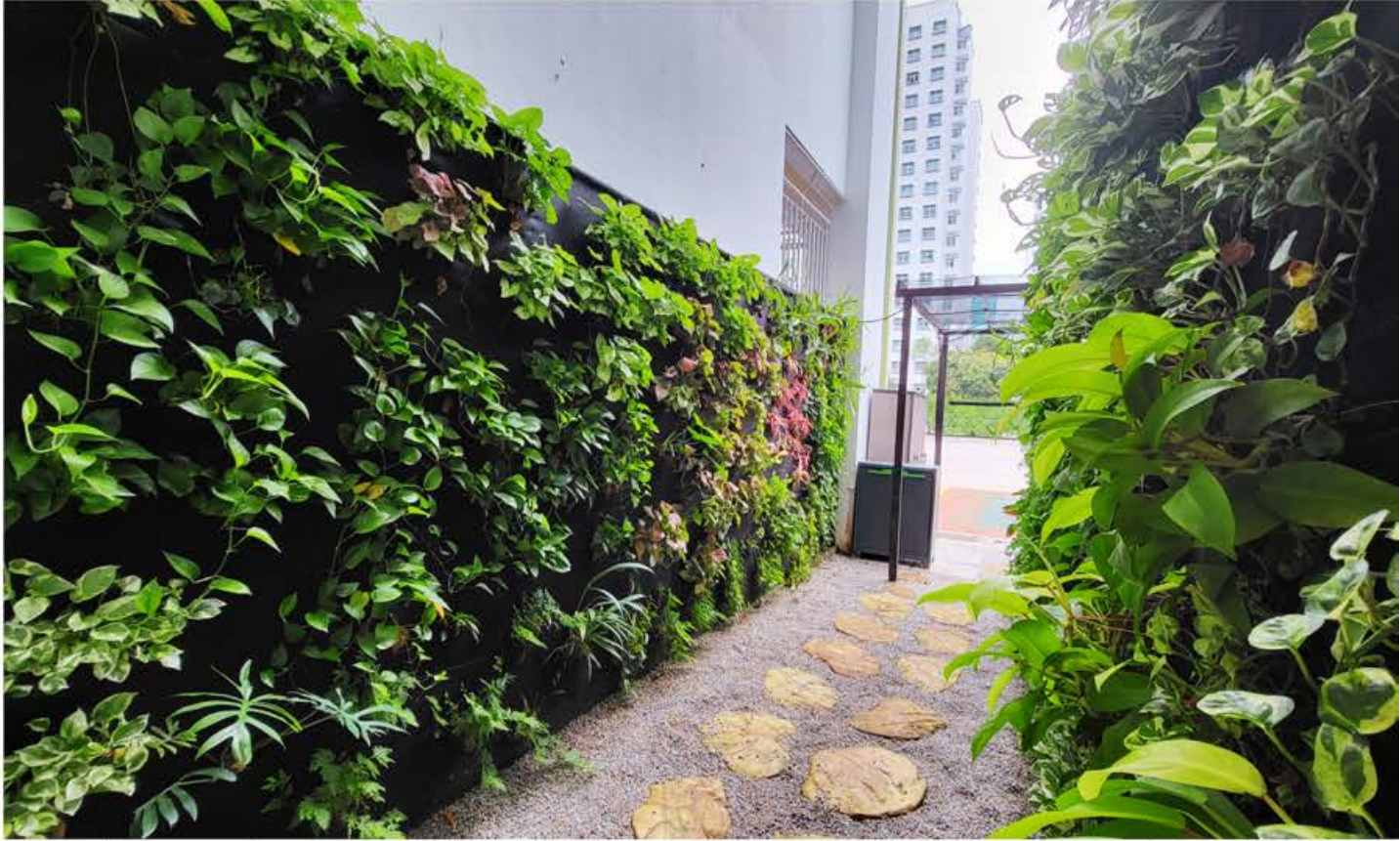
This vertical greenery installation is constantly monitored by the students who promptly carries out any place replacement and enhancement works.

The vertical greenery at Greendale Primary School has provided a hands-on learning platform for students and has become a valuable tool for nurturing the next generation of growers and thinkers. The project has helped the students to develop a sense of ownership and responsibility for their environment, while also promoting the importance of sustainable practices and hands-on learning.