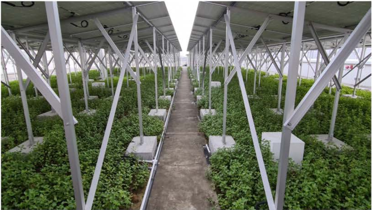
Design considerations for such a co-location set up include access pathways and ensuring sufficient height clearance to facilitate regular maintenance.

Spanning over 3000sqm, this solar green roof adds an eye-catching splash of greenery over the once grey and monotonous industrial estate rooftop. Species used included drought-tolerant, low-lying ground cover such as Sphagneticola trilobata and Cyanotis cristata . The synergistic effects from integrating solar panels and green roof installation reduces the urban heat island effect and improves the output performance of the installed solar panels due to the evapotranspiration process of the green roof.