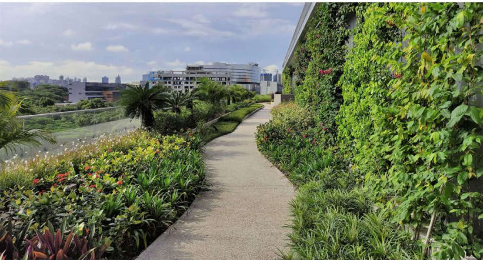
When designing the multiple roof gardens, native and adaptive plant species were selected to reduce water and maintenance requirements.