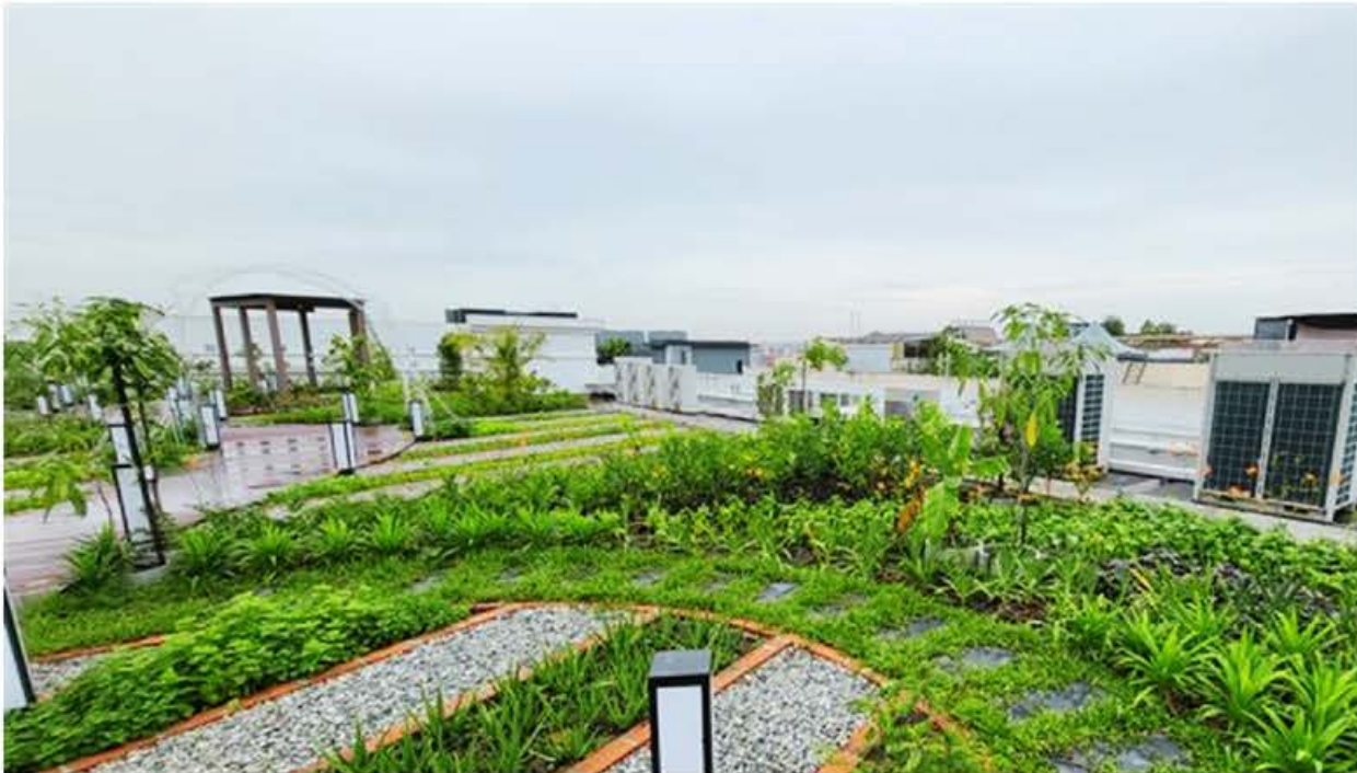
The garden was designed with pavements that lead visitors into the planting beds, promoting interactions with nature.

These design features are intended to optimize the biophilia hypothesis, which suggests that people have an innate emotional affiliation to nature and other living beings and derive benefits from contact with nature.