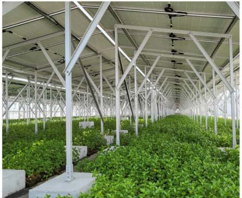
By co-locating green roof with solar panels, a wider range of benefits is reaped on the same rooftop space.