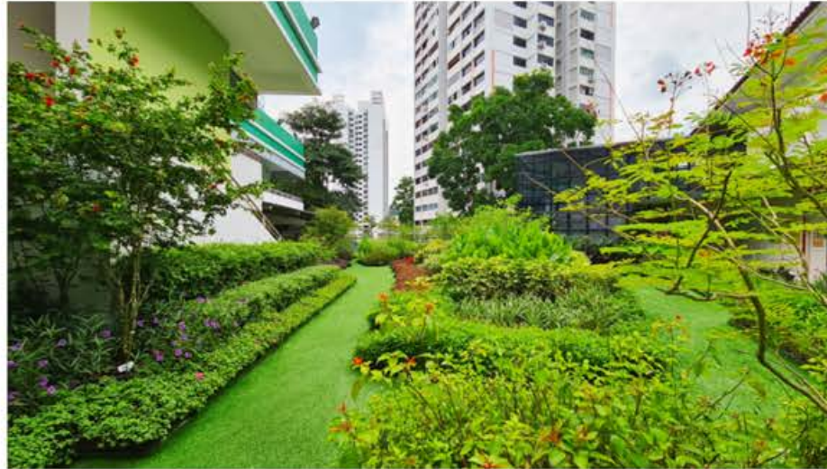
The garden's plant palette was specially curated to include flowering and biodiversity-attracting plants to enrich the students' learning.

Besides being a beautiful and sustainable addition to the school, the 'Garden of Hope' provides students with a unique opportunity to connect with nature and learn about sustainable practices.