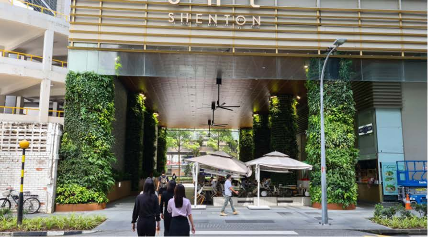
The green columns enhances the building and environmental sustainability of the area.

To enhance the environmental and visual impact, the green walls wrap the entire height of the columns from floor to ceiling. As the green wall plants directly below the ceiling receive limited natural sunlight, plant grow lights have been put in place to increase the variety of plants that can be used. In addition, different plant species were also deployed throughout the column's height in response to the different light conditions. In total, there are approximately 40 species of plants grown throughout the building, including trees, palms, shrubs and climbers.