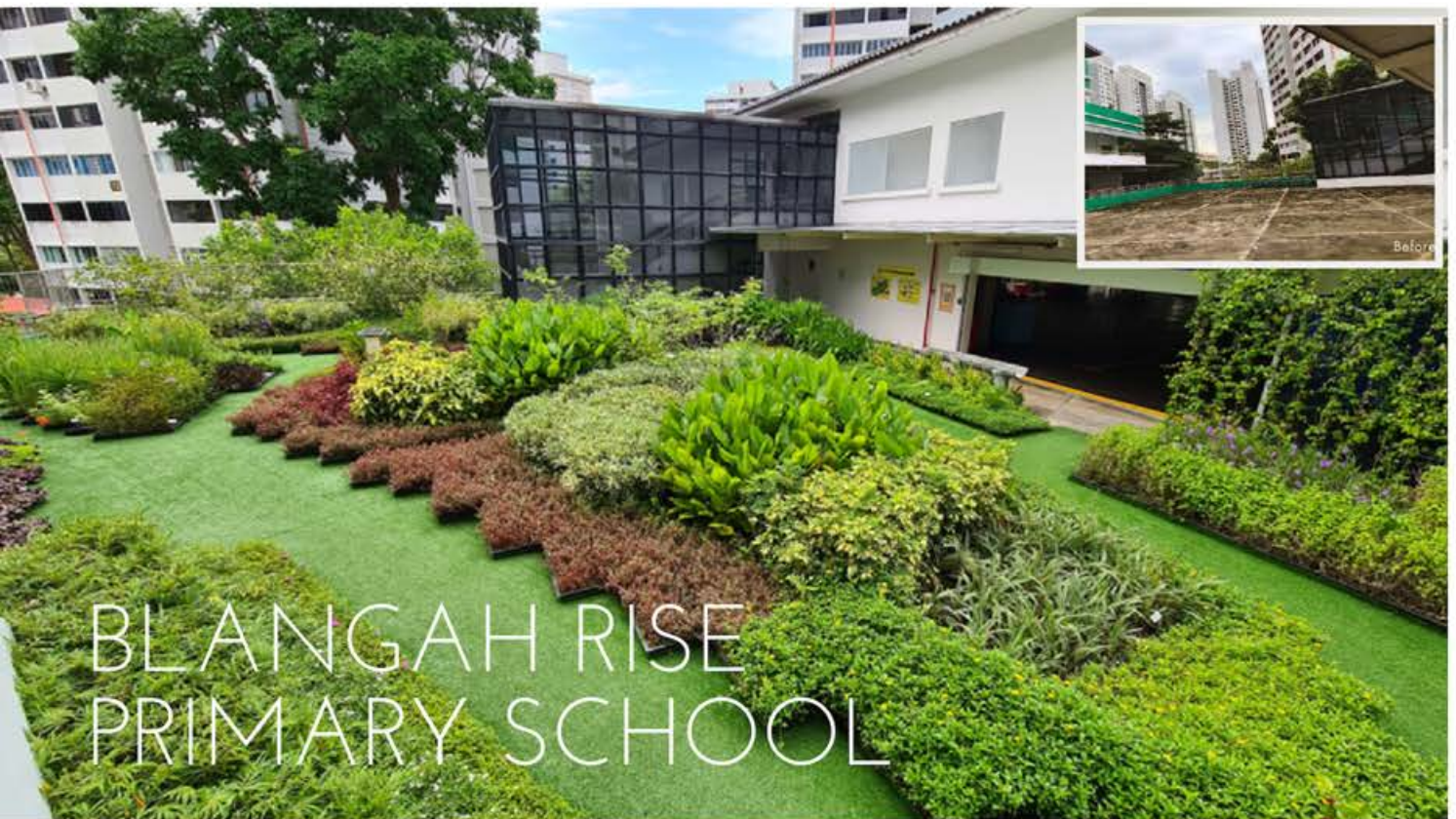
Blangah Rise Primary School's rooftop garden is located along a thoroughfare that students use to get to their classes, greatly increasing the students' touch points with nature when compared to the bare concrete roof before (insert).